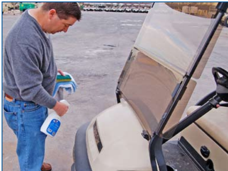
Spray on front