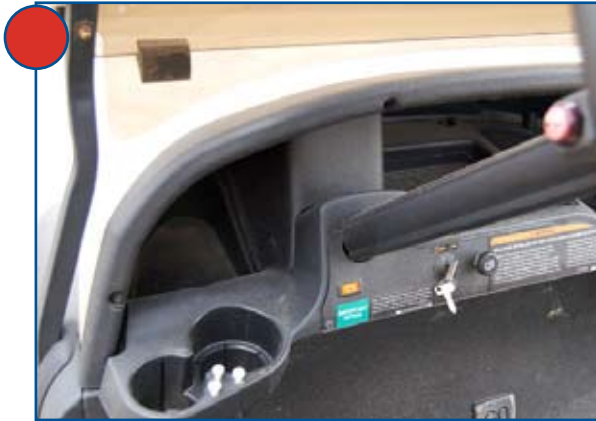
Unacceptable interior components