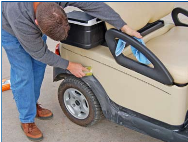
Side & rear body